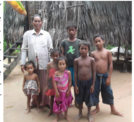
children and food.

Therefore, PSE intervened: school for the older