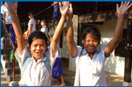
Registered charity Human rights award